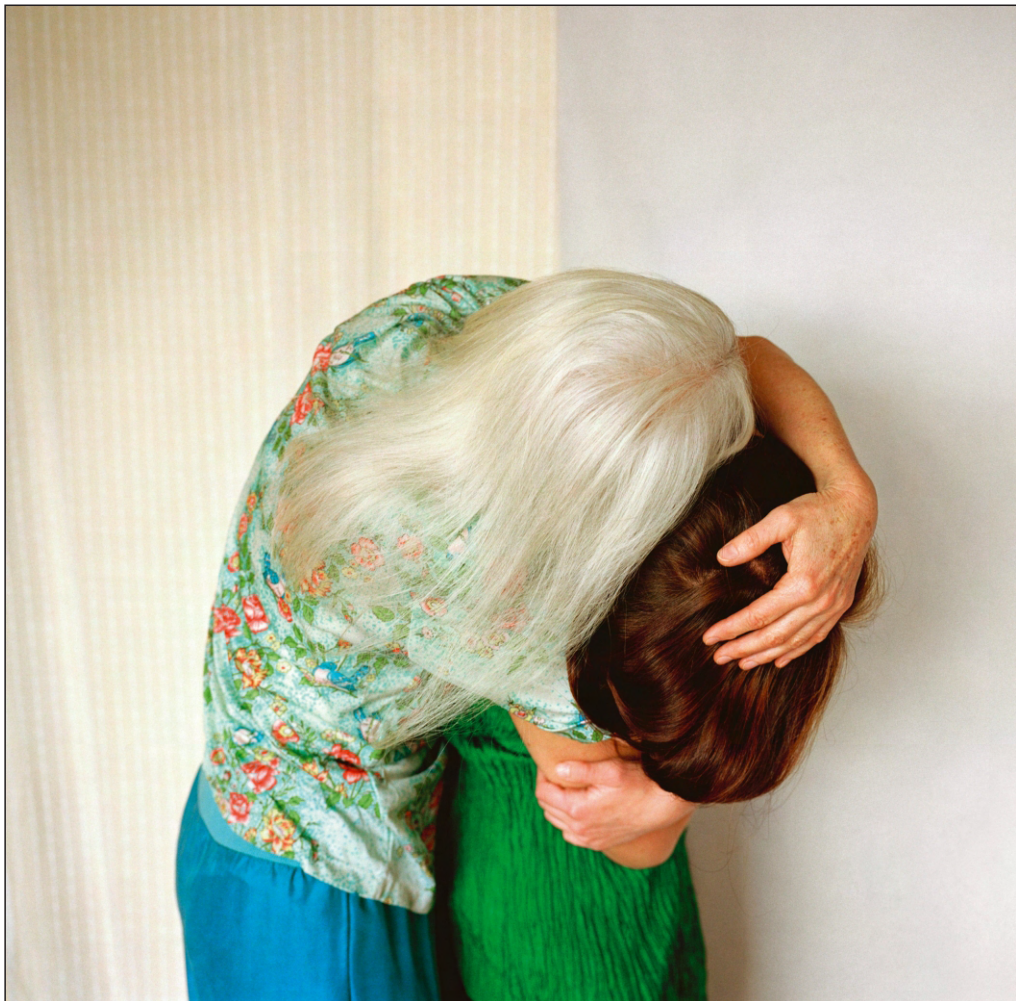
Ute Klein, Resonanzgeflechte, 2009, www.guteaussichten.org

4th international photography biennial Amsterdam metropolitan area